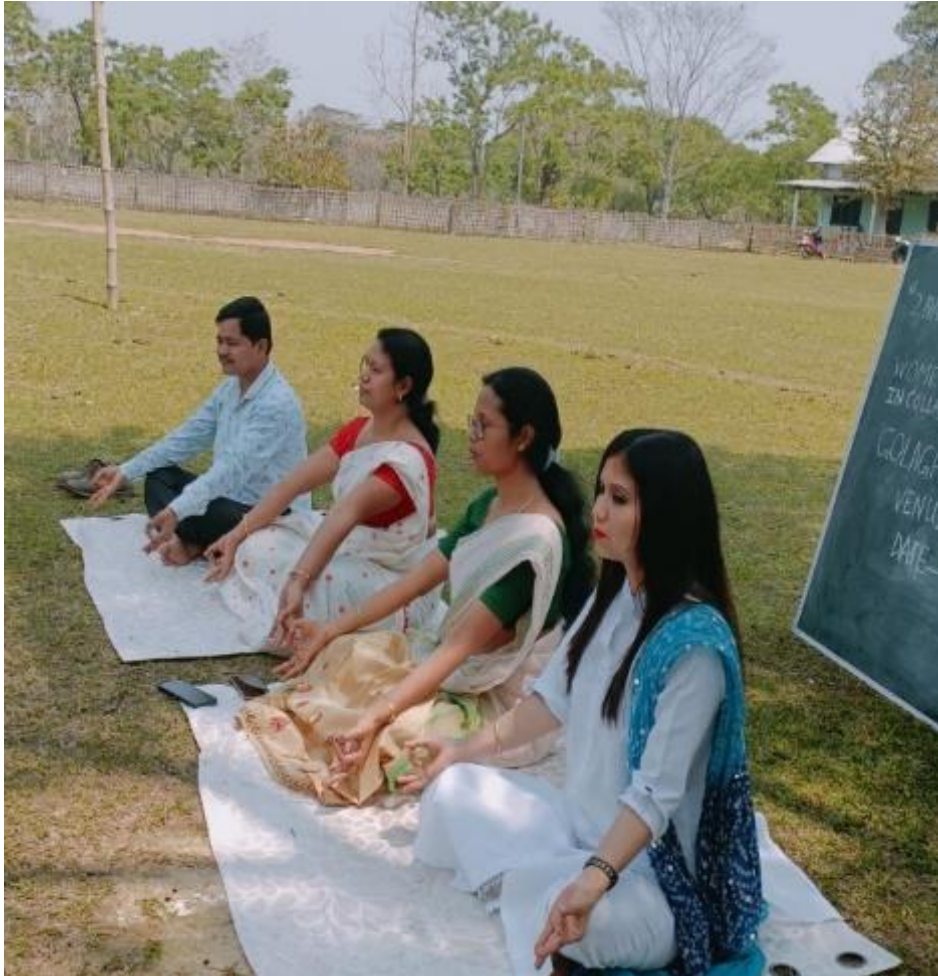
YOGA LIFE SKILL SESSION 2019-2020, 05.07.2019 and 06.07.2019