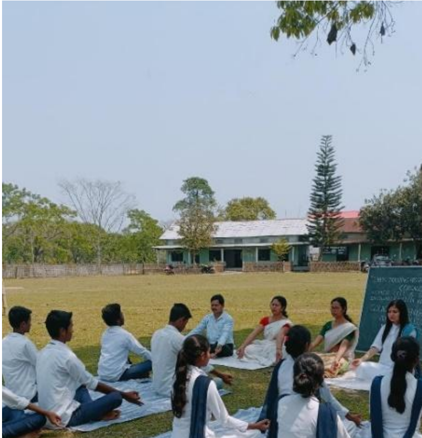
YOGA LIFE SKILL SESSION 2019-2020, 05.07.2019 and 06.07.2019