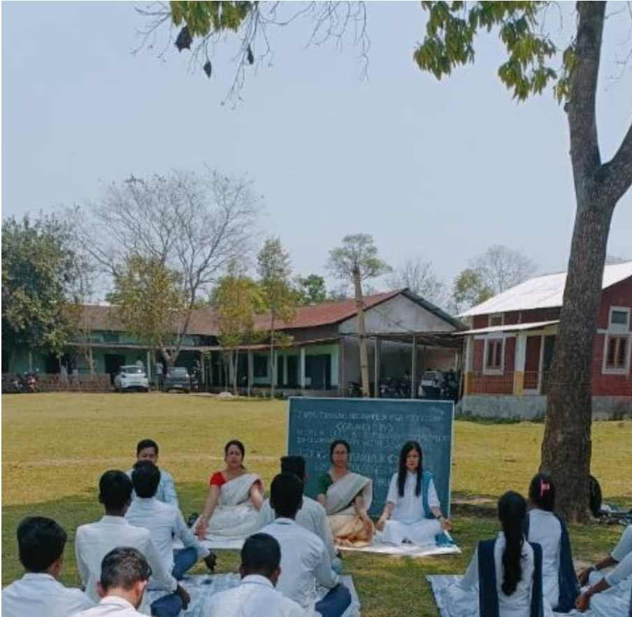
YOGA LIFE SKILL SESSION 2019-2020, 05.07.2019 and 06.07.2019